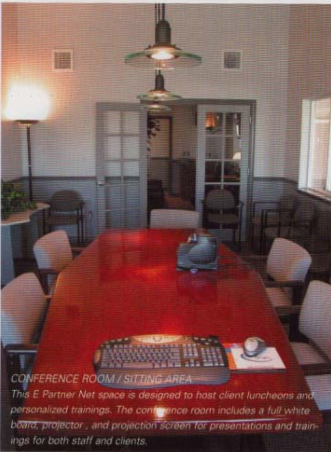
CONFERENCE ROOM / SITTING AREA This E Partner Net space is designed to host client luncheons and personalized trainings. The conference room includes a full white board, projector, and projection screen for presentations and trainings for both staff and clients.